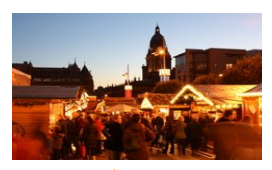
Saturday 3<sup>rd</sup> December 2011

Coaches Leaving County Hall 8:00 am Returning to Durham 7:00 pm £5:00 for Members