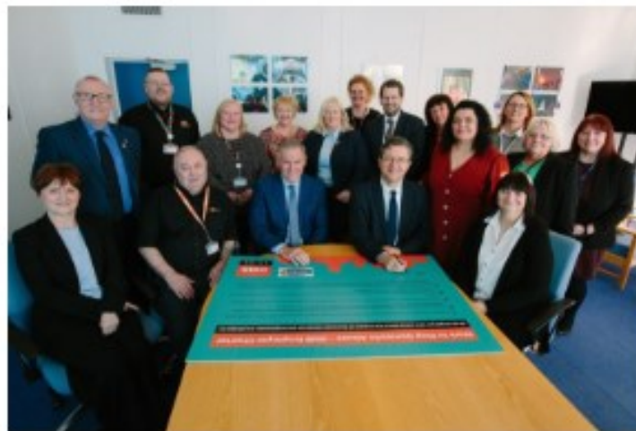
Durham county Council Domestic Abuse charter signing at County Hall.

A North East council has signed the Work to Stop Domestic Abuse charter as part of GMB's campaign for greater support for employees experiencing domestic abuse.