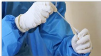
Screening & isolation