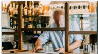
Safe systems of work